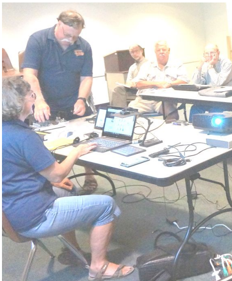
The Computer Geeks prepare for their talk in November, 2015.